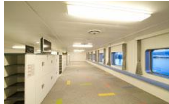
Comfort( up to 4 people)