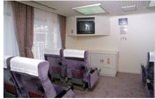
Economy( 2nd Class)